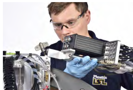
Modular by design – Attaching junction box