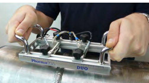
Hand-held Duo scanner

Economical yet packed full of features, Duo is a robust operator-friendly TOFD scanner for reliable on-site pipe weld inspections.